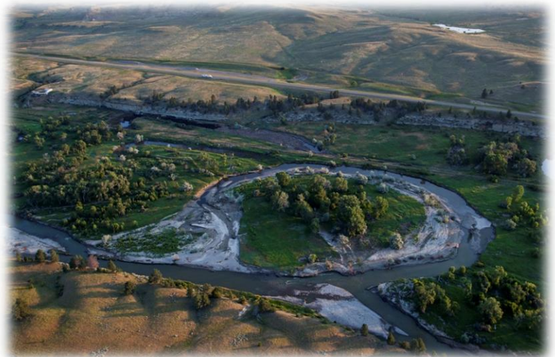
Figure 3. Meander cutoff formed by 2011 flood.

The most common form of an avulsion that occurred in 2011 is a bendway cutoff. This happens when a meander bend forms a new, shorter channel through its core. This is a common, natural river process that leaves floodplain swales known as oxbows. As they evolve, oxbows generally form first as open water wetlands, then continually fill in with fine sediment to become a low, arc-shaped floodplain swale/wetland. Meander cutoffs have posed problems for producers in the corridor, as the avulsions have commonly isolated land, eroded fields, and abandoned infrastructure (pump sites, diversions, bridges, etc.). As such, these sites have been commonly considered for re-activation; that is, putting the river back into its original pre-avulsion course.