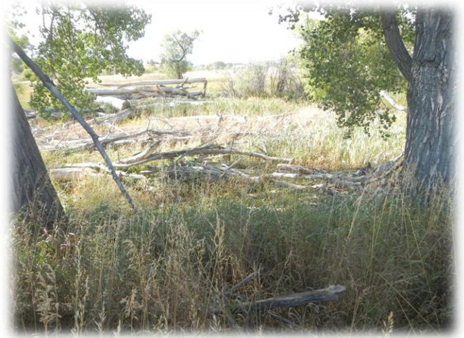
Figure5. View of flood debris trapped in wetland swale from edge of irrigated field.