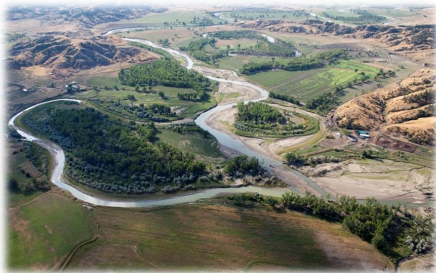
Figure 1. 2011 avulsion, Musselshell River.

The following Best Management Practices (“BMPs”) summarize several recommended approaches to managing abandoned channels within the Musselshell River stream corridor. The information is based upon the on-site evaluation of floodplain features and discussions with producers, and is intended for producers and residents who are living or farming in areas where abandoned channel segments exist.