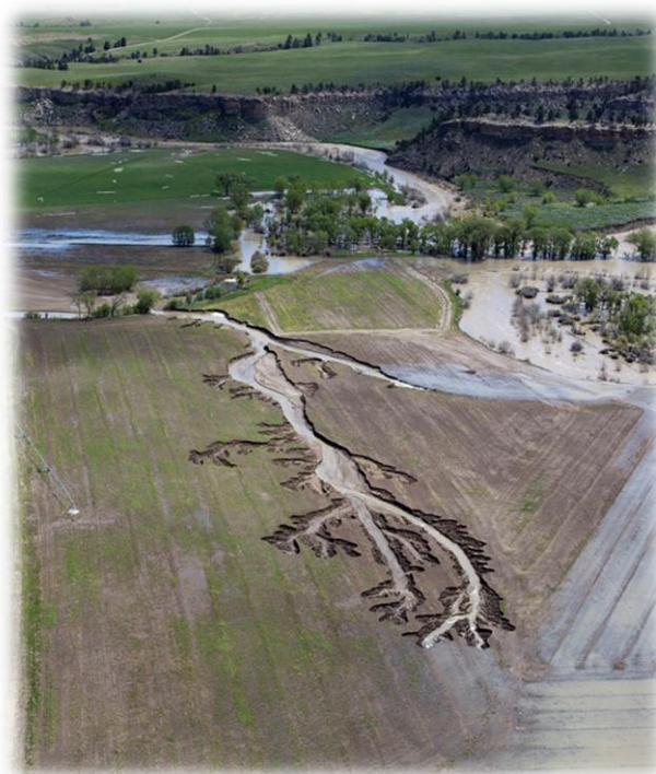
Figure 2. Upstream-migrating headcuts showing creation of avulsion path, 2011.

Perhaps the most dramatic 2011 flood impact on the Musselshell River was the number of avulsions that occurred over the period of a few weeks. An “avulsion” is the rapid formation of a new river channel across the floodplain that captures the flow of the main channel thread. River avulsions typically occur when rivers find a relatively steep, short flow path across their floodplain. When floodwaters re-enter the river over a steep bank, they form headcuts that migrate upvalley, creating a new channel, causing intense erosion, and sending a sediment slug downstream. If the new channel completely develops, it can capture the main thread, resulting in a successful avulsion. If floodwaters recede before the new channel is completely formed, or if the floodplain is resistant to erosion, the avulsion may fail. From near Harlowton to Fort Peck Reservoir, 59 avulsions occurred on the Musselshell in the spring of 2011, abandoning a total of 39 miles of channel. The abandoned channel segments range in length from 280 feet to almost three miles. One of the reasons there were so many avulsions on the Musselshell River in 2011 is because the floodwaters stayed